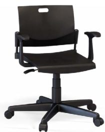
800 Task chair with arms