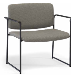
532 Sled base 500lbs capacity