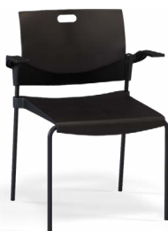
811 Stacker with arms