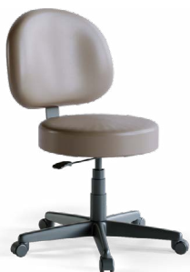
1000WB Stool with back