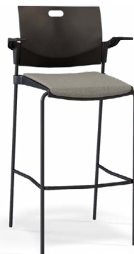
810UFST Barstool with arms, upholstered seat