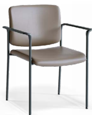
513 Armchair 300lbs capacity