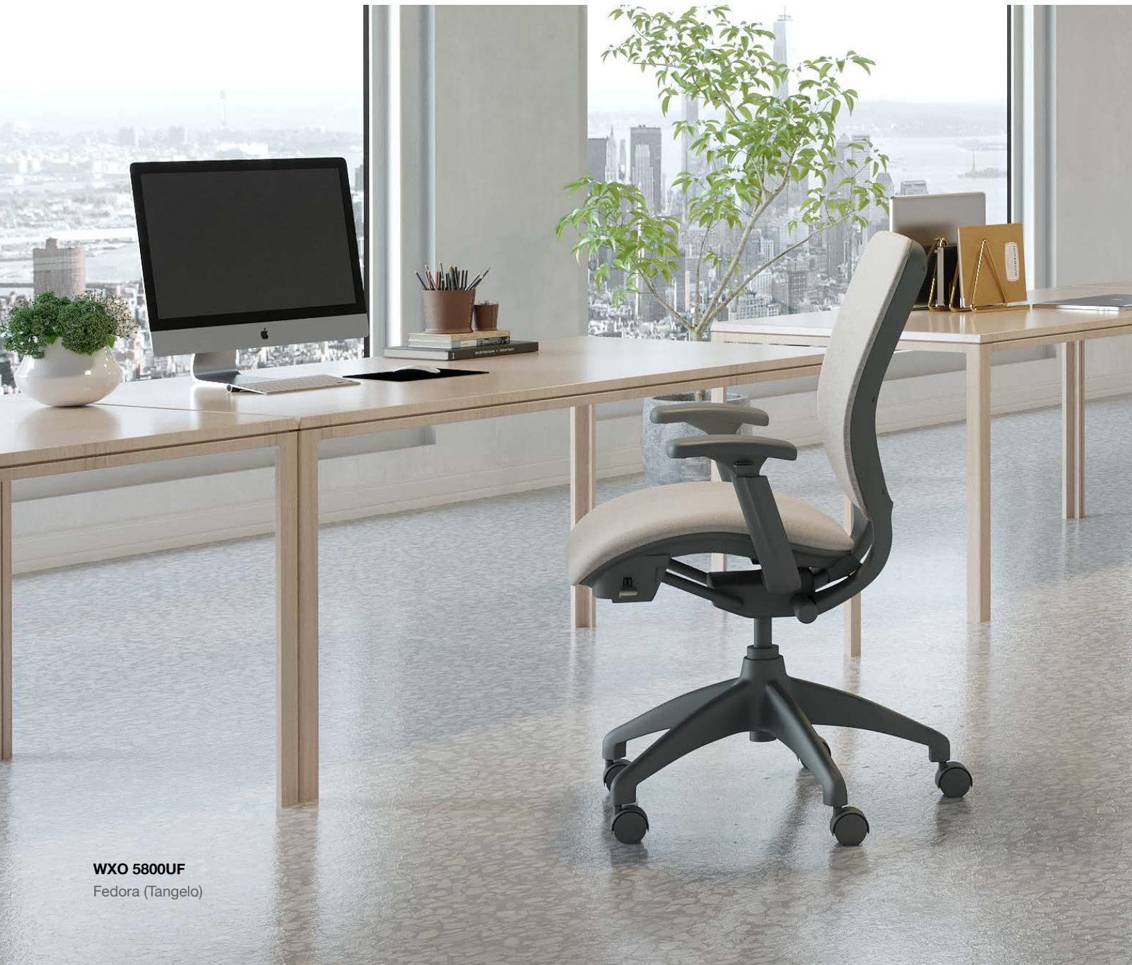
WXO 5800UF Fedora (Tangelo)

WXO chairs design and construction incorporates ergonomic principles and technologies. It sports a refined sleek profile with distinctive comfort and support. Great for healthcare environments.