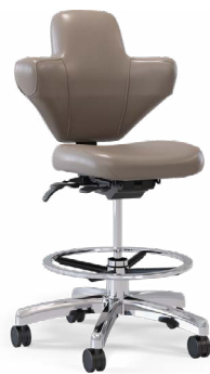
1864-DS Mid back stool