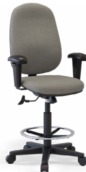
6800-DS Mid back stool