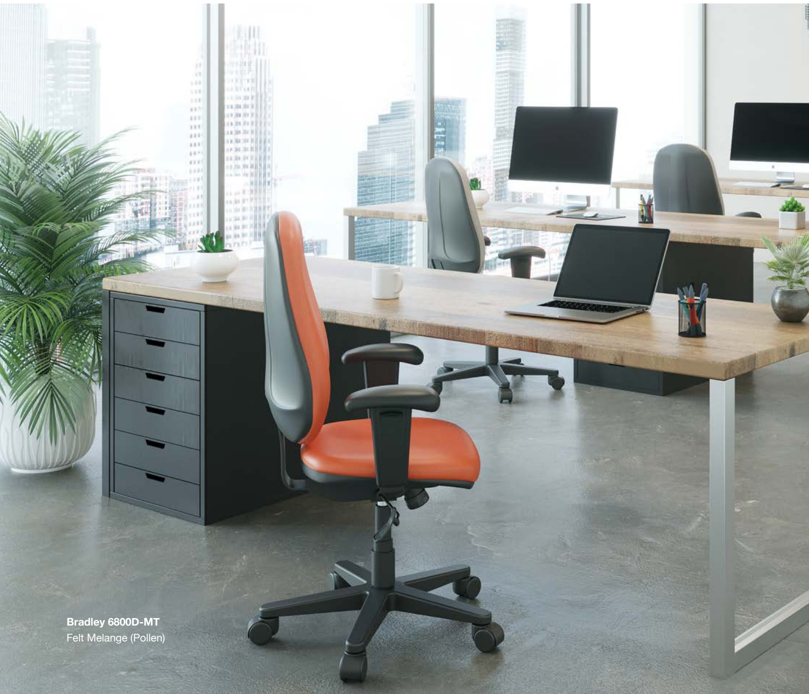
Bradley 6800D-MT Felt Melange (Pollen)

The Bradley was engineered to meet the rigorous demands of modern work spaces. A classic office look is paired with Nightingale's first-class ergonomic technology to create all-day comfort. Bradley will exceed the demands of your workday.