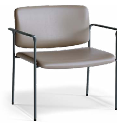
533 Armchair 500lbs capacity