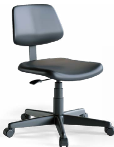
1010 Stool with polyurethane seat and back