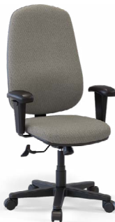
6800D High back