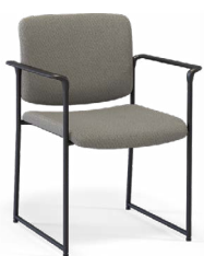
512 Sled base 300lbs capacity