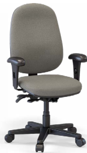
6800 High back