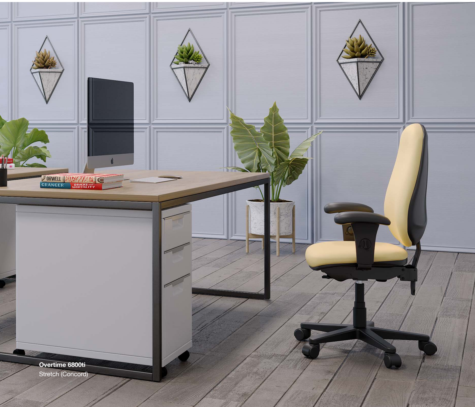
Overtime 6800ti Stretch (Concord)

Double overtime, night shifts, morning hours, round the clock bustle. This heavy-duty task chair can handle it all. The Overtime has a non-stop job to do, just like you. The chair is engineered to provide enduring comfort and support for individuals up to 300 pounds. A sturdy, adjustable back, high density foam, and swivel tilt mechanism make it ideal for 24 hour environments.