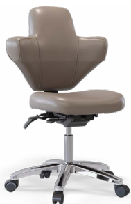
1864 Mid back