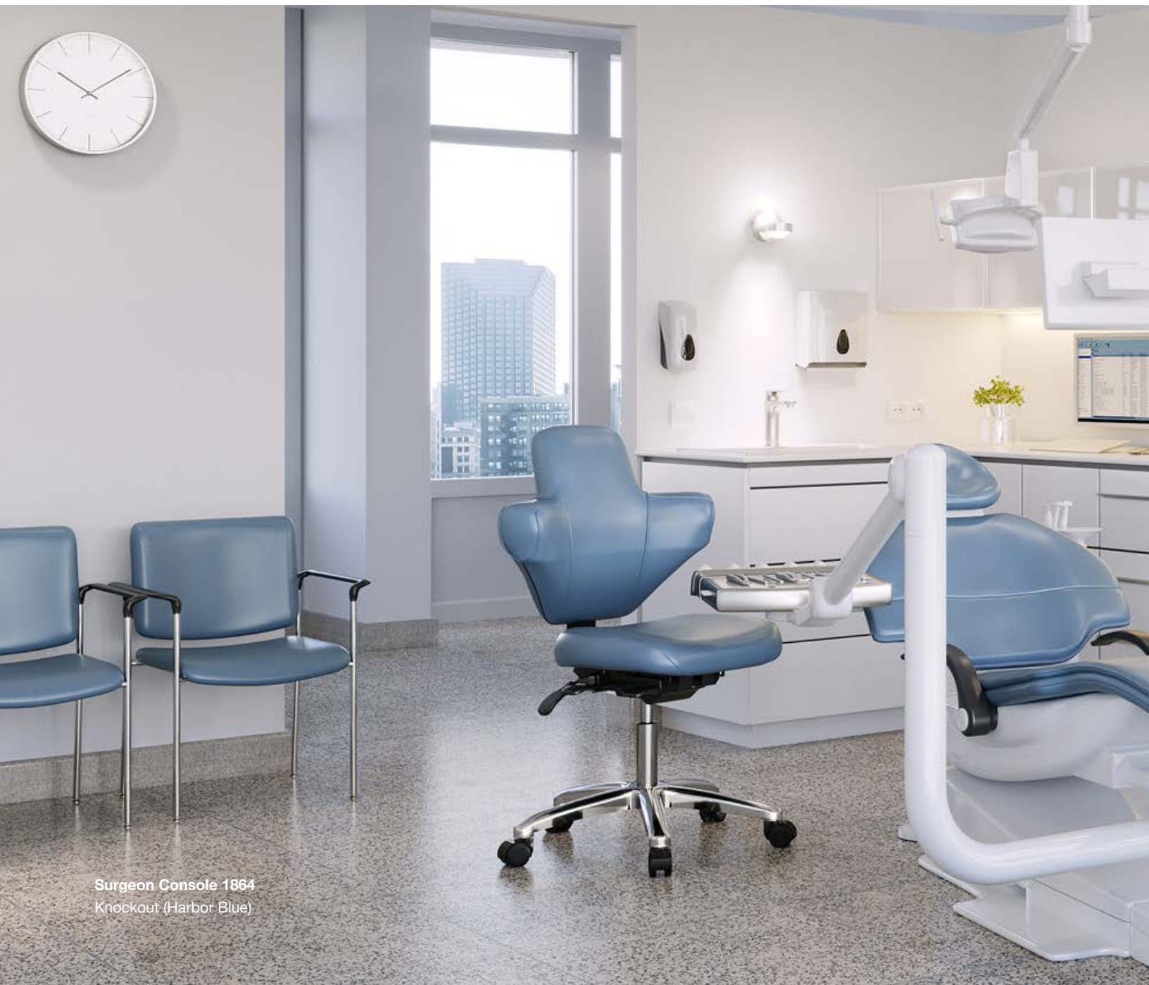
Surgeon Console 1864 Knockout (Harbor Blue)

The Surgeon Console chair was engineered to provide individual comfort and support for prolonged periods of time. The patented self-adjusting back and armrest support offers top-level ergonomic comfort that the user will appreciate.