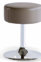
1009 Stool trumpet base