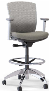
7280-DS-WH Stool, white package