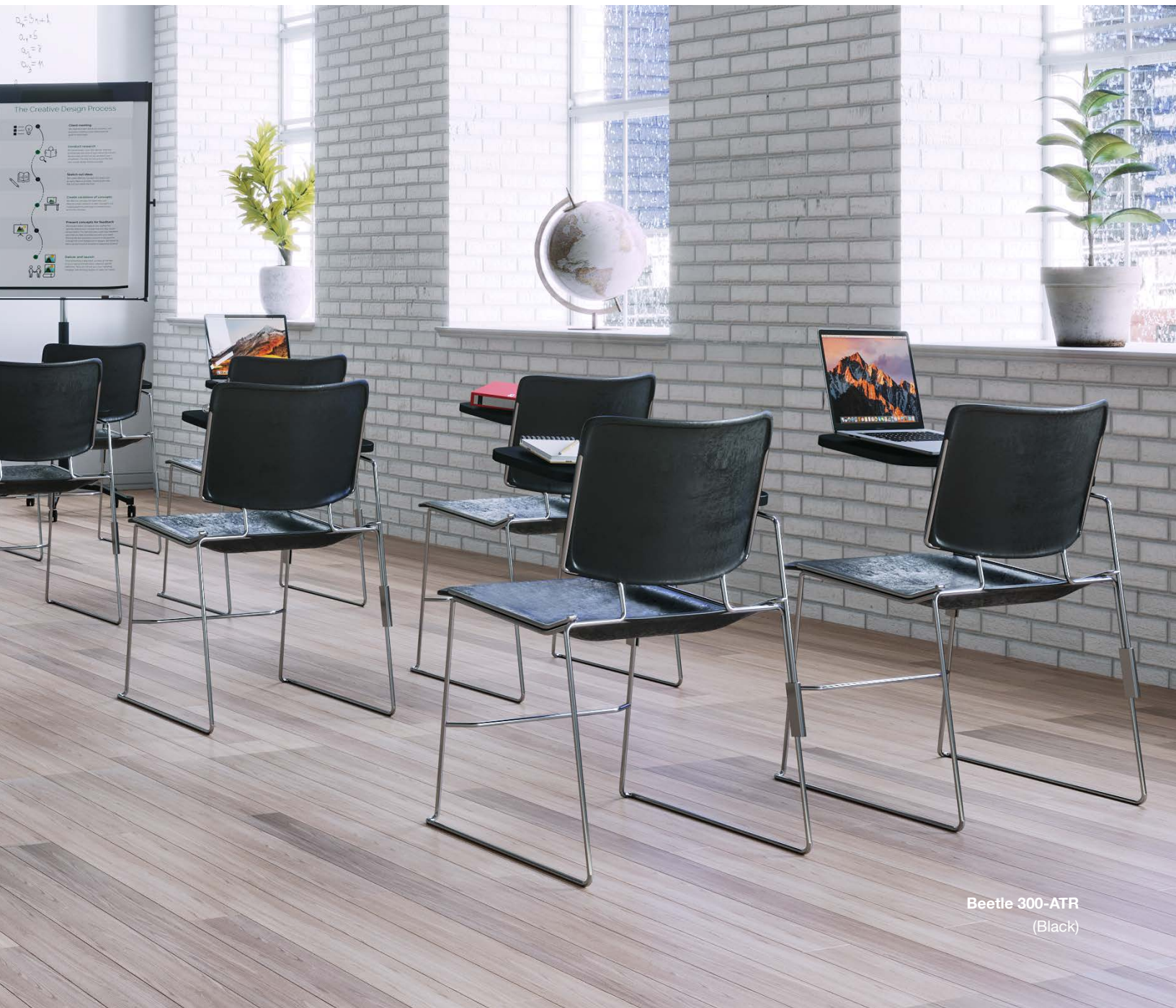
Beetle 300-ATR (Black)

The Beetle is a high-density, stackable chair. Comfortable enough for daily use and easy to store, the Beetle is an all-purpose stacker for educational, institutional, or group seating needs.