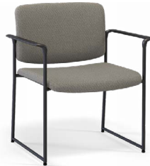
522 Sled base 400lbs capacity